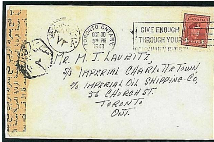
Front of the cover showing the Egyptian censor tape and hand stamps and the fact that the letter was mailed in Toronto on October 30, 1949 for delivery to a Toronto address.

After puzzling over the use of Egyptian censor tape on a cover with no indications it had left Canada, I purchased it, since one seldom finds foreign civilian censor tapes on Canadian covers except during the WWI and WWII periods. I was certain there was an interesting story behind this cover and I hoped some day I might discover what it was!