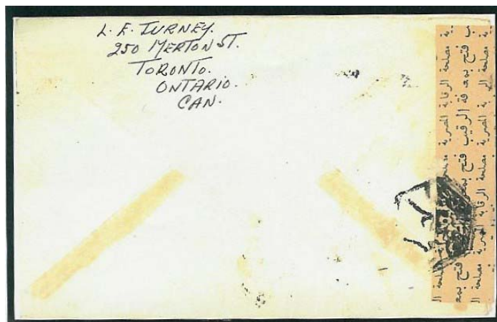
Reverse of cover showing the rest of the Egyptian censor tape and the sender's Toronto return address