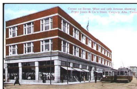
Canadian Army Services Corps Headquarters Military District 13, Calgary, Alberta