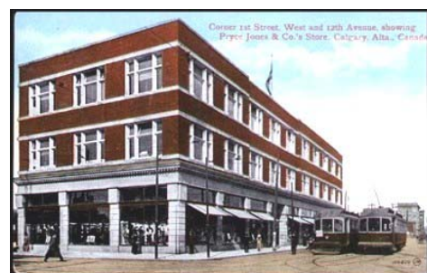
Canadian Army Services Corps Headquarters Military District 13, Calgary, Alberta